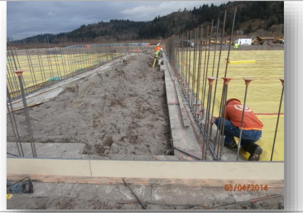
Preparation for floor slab at Main Gym and Aux Gym