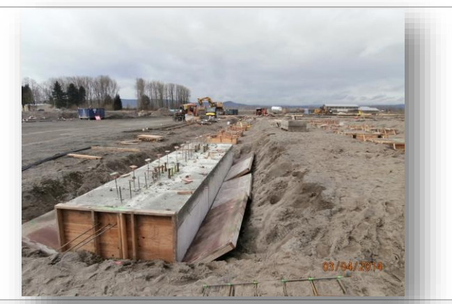
Form work along south side of South Classroom Wing