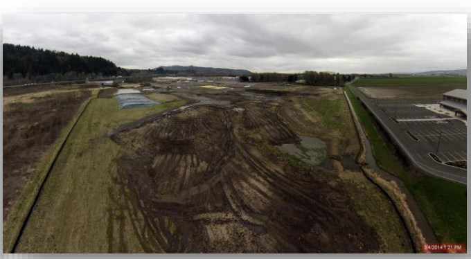
Aerial photo – looking south east from NE corner