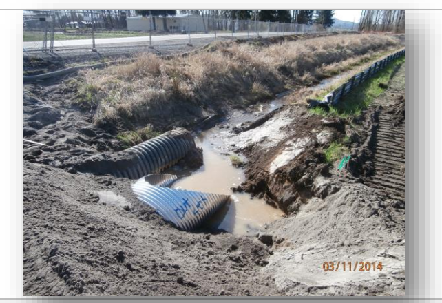
Culverts at driveways along Dike Access Road