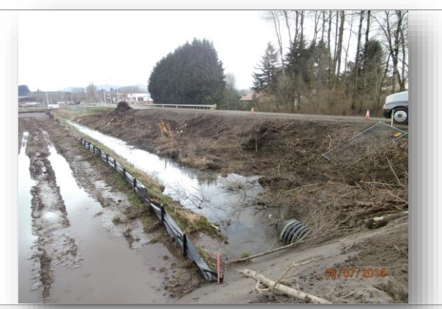
Clearing and ditch work along Dike Access Road