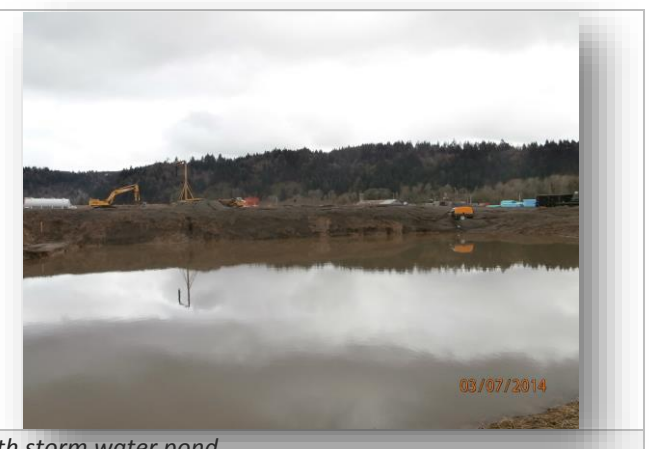
South storm water pond