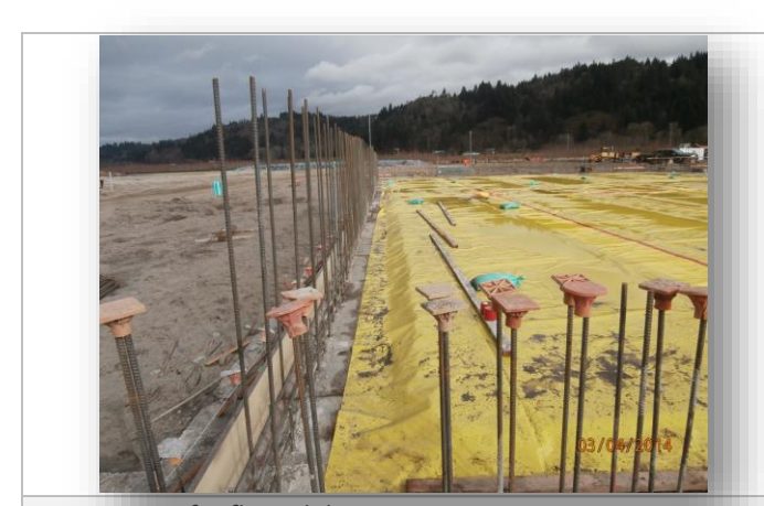
Preparation for floor slab at Aux Gym