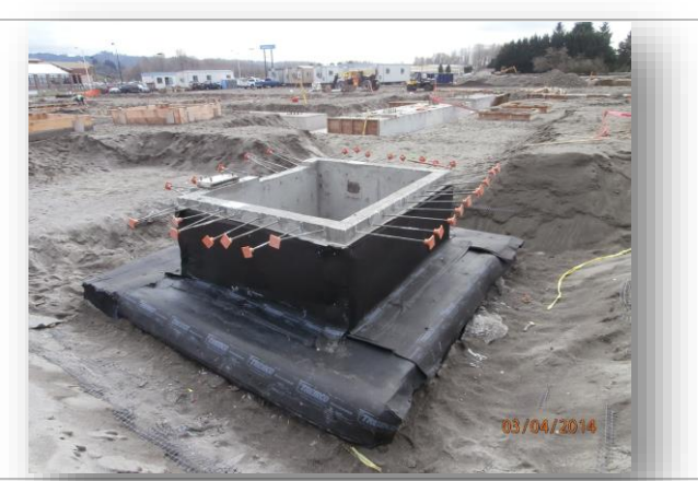
Form work and footings at elevator pit