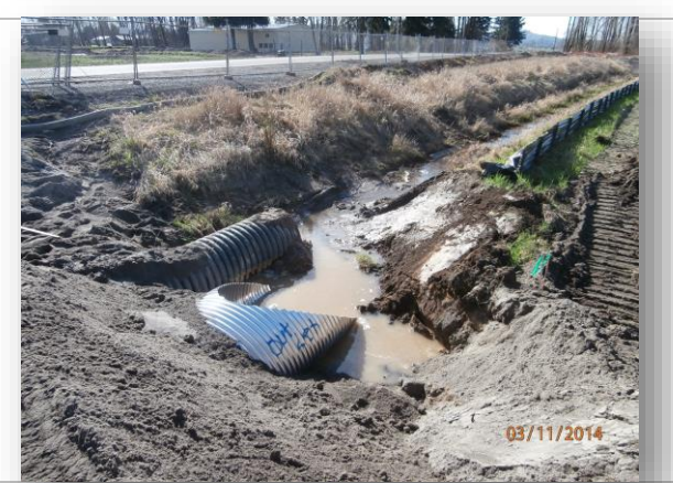
Aerial photo – looking south from north property line