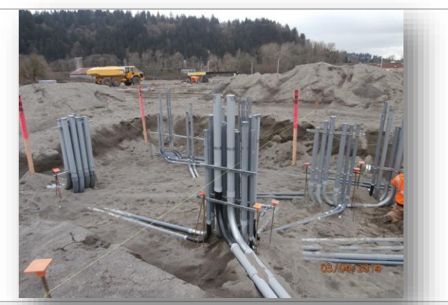
Underground electrical conduits in main Electrical Room