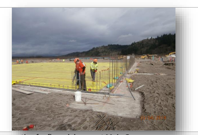
Preparation for floor slab pour at Main Gym