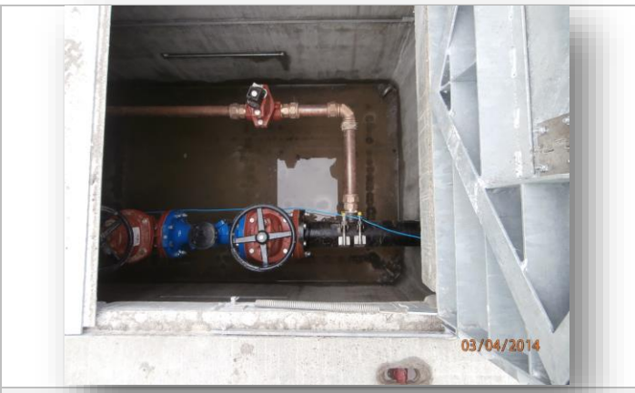
Domestic water line vault